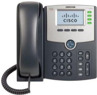
Cisco SPA 508G

Professional Cisco phones for small and medium businesses – 4 to 32 lines. Cisco SPA 508G has 8 lines. Cisco 525G comes with Wi-Fi if you need to cut the cord.