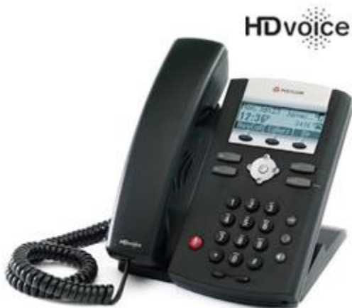
Polycom IP phone 335

High quality business phones ranging from 2 lines to 16 lines, IP 335 being the one of the most popular model for SoHo whereas IP550 is preferred by SMBs. Conference phones are also available for group meeting.