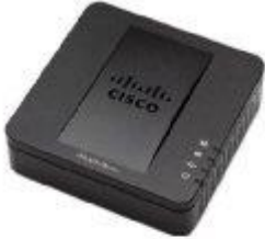
Cisco SPA-122 (ATA)

2-line ATA adapter to connect old analog phone lines with IP service. This is a perfect option for homes.